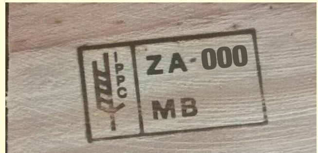
Example of MB mark

A list of registered service providers and further information on the regulation is available on DAFF website, www.daff.gov.za > Branches > Agricultural Production Health & Food Safety > Inspection Services > Wood Packaging.